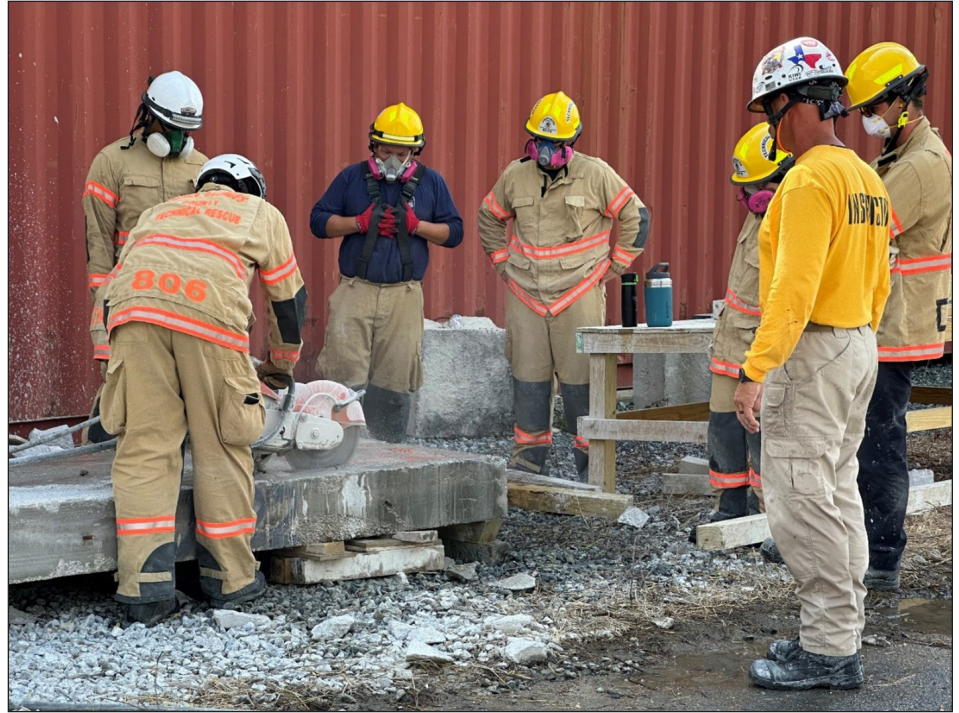
MDERS sponsored MCFRS and PGFD personnel.

■ Breaching: Students learned techniques to break through and access obstructed areas. Participants drilled holes in a triangle formation, then chiseled away the surrounding areas, allowing the triangle to be lifted out, revealing an opening for entrance or extraction.