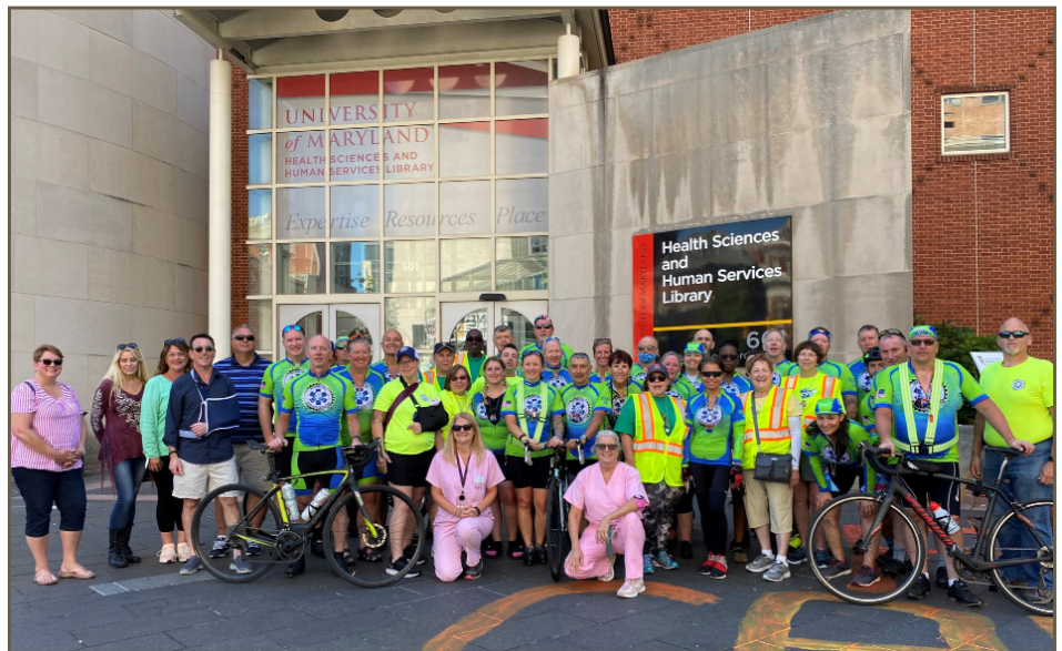
▲ The East Coast route of the National EMS Memorial Bike Ride stopped in Baltimore on their last day on their way to Washington, D.C.

The mission of the group is to honor the service and commitment of EMS professionals through long-distance bicycling events. Their vision is to reduce illness, injury, and