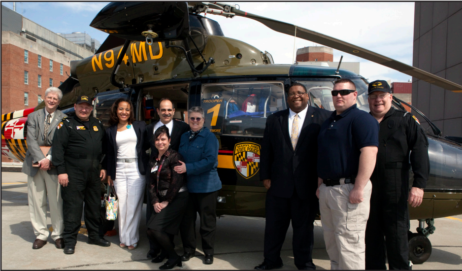
The group was able to view Trooper 1 of the Maryland State Police's Aviation Command following their delivery of a patient to the University of Maryland R Adams Cowley Shock Trauma Center.