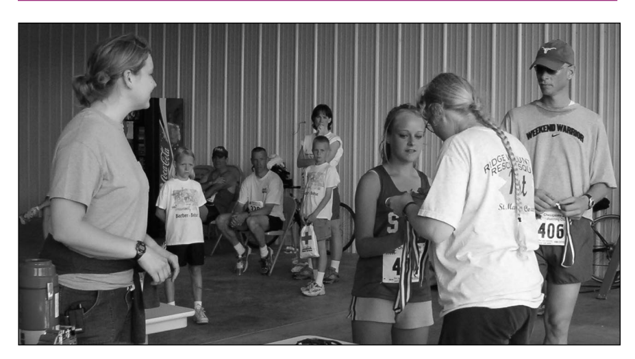
The Ridge Volunteer Rescue Squad sponsored a 5K Run/Walk Fundraiser.

Below is a sampling of EMS activities across the state: