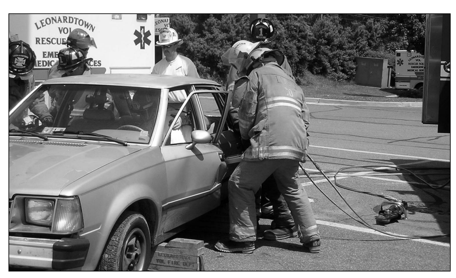
Members of the Leonardtown Volunteer Rescue Squad "pop" the door during an auto extrication demonstration.