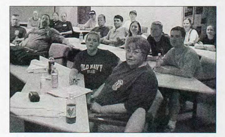
EMS providers take a break during an "Abdominal Trauma" lecture offered by Prince George's Hospital Center.