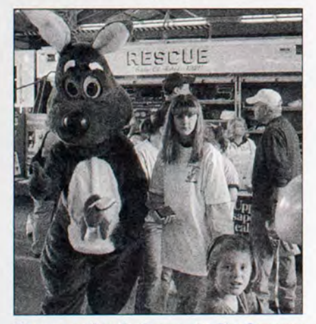
"Trauma-roo" at the Community Fire Company of Rising Sun.