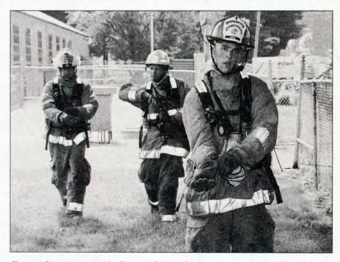
Responding to a gas pipeline explosion during an exercise in Western Howard County, emergency workers will find more than 80 moulaged patients who need to be assessed, triaged, treated, and transported.

as well as officers from the Harford County Sheriff's Office and the Maryland State Police (MSP) participated as responders to the mock incident. After the initial dispatch for a report of an unknown medical emergency, responders were soon informed that there were also reports of a possible explosion heard in the area.