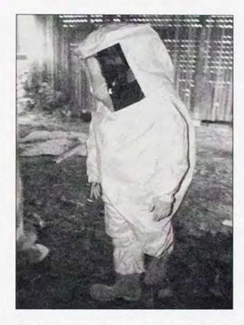
Protective gear is worn by emergency responders following gunfire and explosions during a drill in Carroll County.