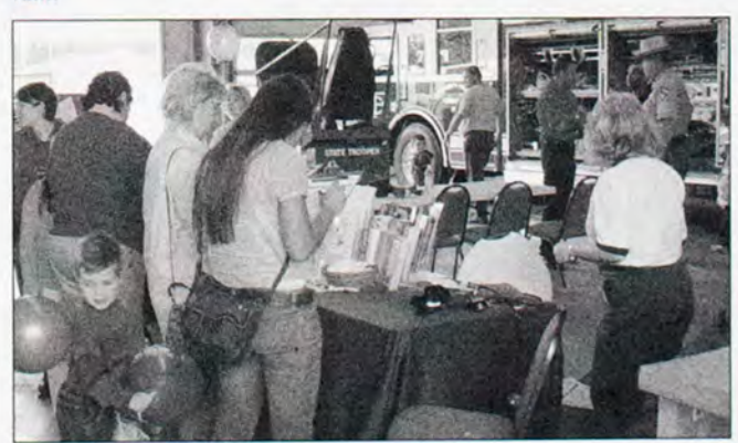
One of many displays at the Community Fire Company of Rising Sun.