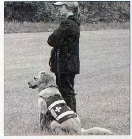
A search dog demonstration at the Community Fire Company of Rising Sun.

Volunteer Rescue Squad held an open house during EMS Week.