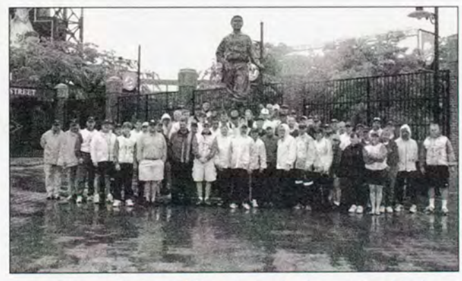
Some of the more than 100 EMS professionals who participated in the National EMS Memorial Bike Ride after they arrived in Baltimore in the rain.