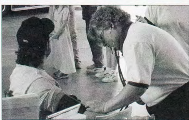
Blood pressure screening (Community Fire Company of Rising Sun).