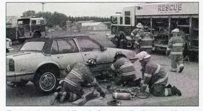
Demonstrating rescue skills at the Community Fire Company of Rising Sun.

Volunteer Rescue Squad held an open house during EMS Week.