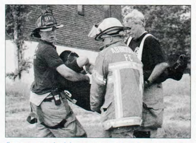
Emergency responders help an apartment resident who was overcome by toxic gas during a drill in Harford County.

Emergency workers soon found themselves faced with two apartment buildings in which occupants had been exposed to an unknown toxic gas and were experiencing symptoms such as respiratory distress, minor trauma, and psychological reactions that are common during large-scale incidents. Responders worked together to rapidly secure the scene, access and triage patients, and transport moulaged patients to five different hospitals in the Baltimore metwere active particitions and incident