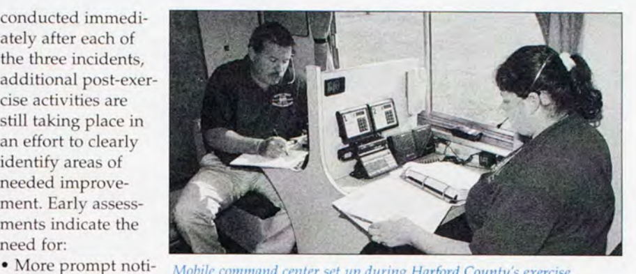
Mobile command center set up during Harford County's exercise.