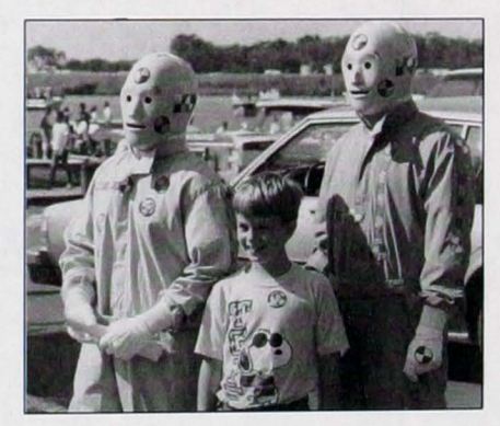
Crash dummies Vince and Larry stressed seat belt safety on EMS Awareness Day at Sandy Point State Park.