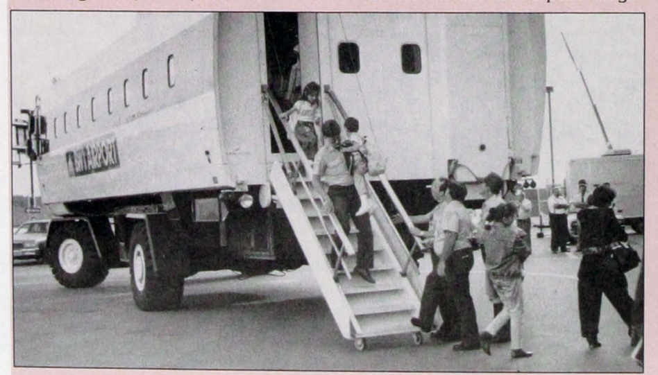
Evacuees from the Persian Gulf disembark from an airport bus at BWI Airport

forget: on September 10, 15, and 16, jets carrying those being evacuated from Kuwait and Iraq landed at Baltimore International Airport. Large