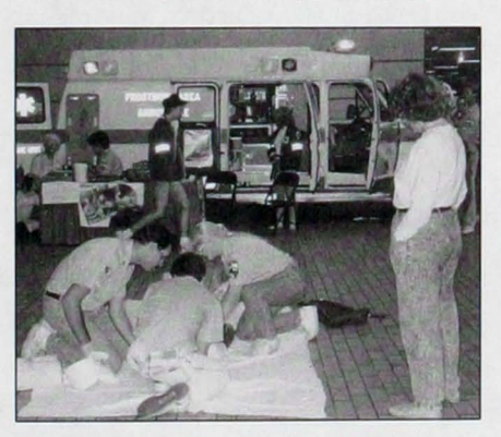
Members of the Frostburg Area Volunteer Ambulance Company demonstrate patient assessment at the Country Club Mall.