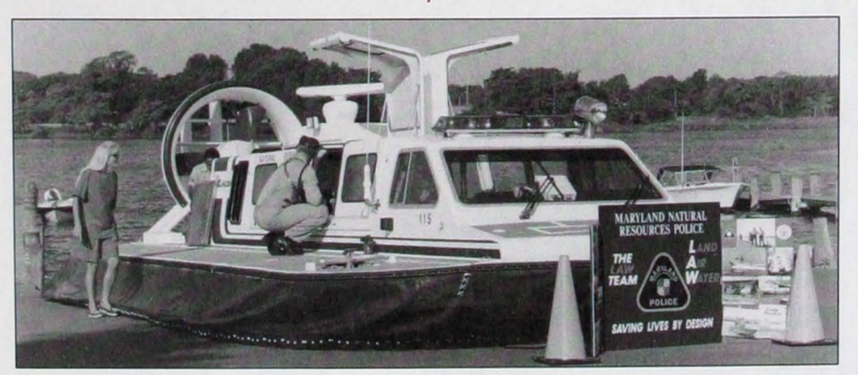
The Maryland Natural Resources Police had a hovercraft (left) and patrol helicopter (right) on display at Sandy Point State Park on EMS Awareness Day.