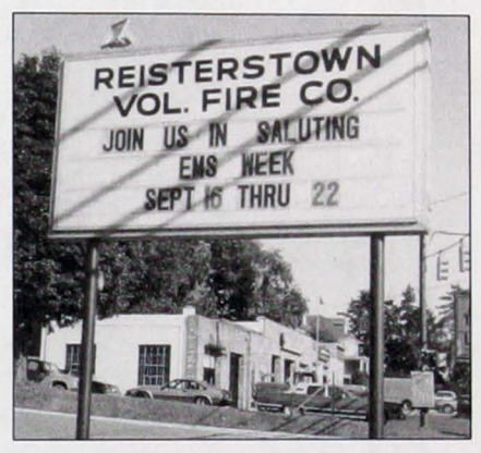
Signs of EMS Week...