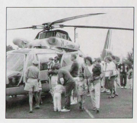
A Maryland State Police helicopter on display at the Washington County Hospital picnic.