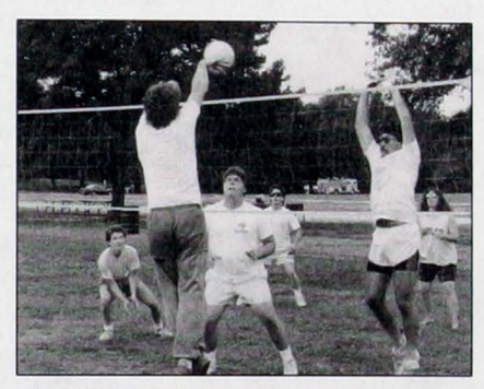
An EMS volleyball game in progress at Sandy Point State Park.