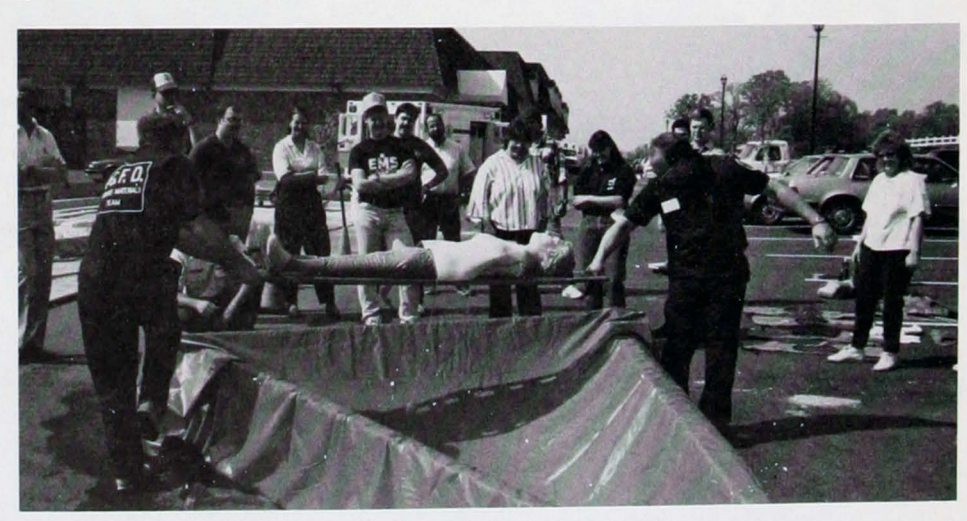
Members of the PG Fire Dept. Haz-Mat team demonstrate decontamination procedures for patients.