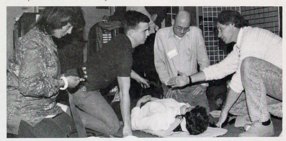
Vendors demonstrated how to use their specific equipment during the workshop on spinal immobilization.