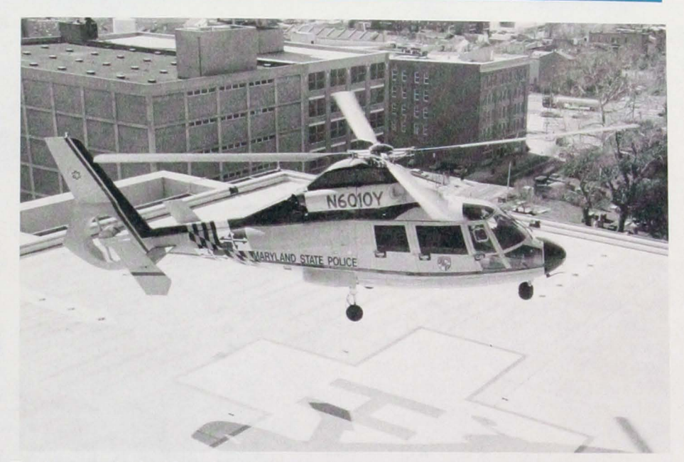
The first new 365N-1 Dauphin 2 helicopter in Maryland becomes operational on April 7.

When only the old Shock Trauma Center building was in use, helicopters had to land on top of a nearby parking lot; the patient was transferred to an ambulance and driven down the seven corkscrew levels of the garage; driven down the street; and off-loaded from the ambulance near the dumpster outside the hospital. Then the patient