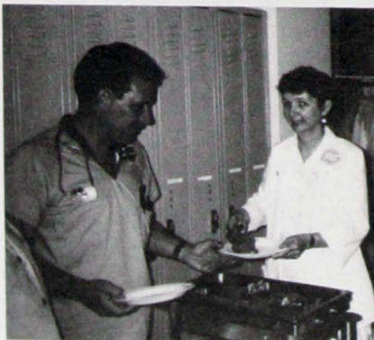
Southern Maryland Hospital Center honored its ED employees at a "recognition luncheon."