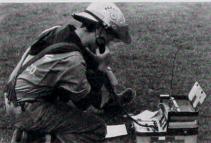
The EMS communications officer during Harford County's disaster drill.