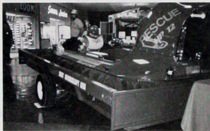
A rescue hovercraft was displayed at the Valley Mall in Hagerstown.