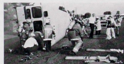
Initial rescue efforts during Harford County's disaster drill.