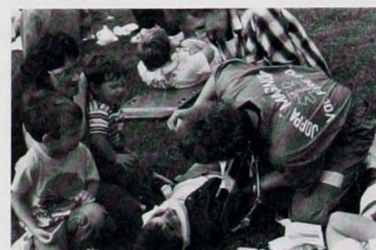
The secondary triage area of the disaster drill at the Magnolia Middle School in Harford County.