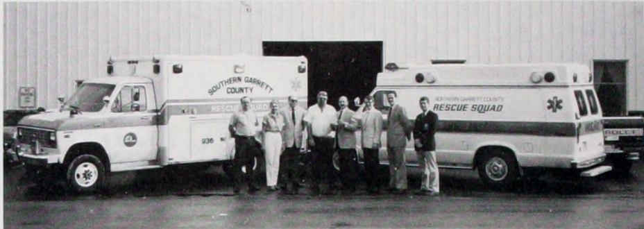
Members of Northern and Southern Garrett County Rescue Squads receive the EMS Week proclamation from Garrett County commissioners.