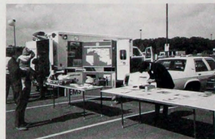
MIEMSS and Harford Memorial Hospital exhibited at the Harford County Fire Expo.

the western Maryland regional office of the Maryland Fire and Rescue Institute, Mothers Against Drunk Driving, and MIEMSS. Community Rescue Service demonstrated its EMS equipment, and a rescue hovercraft was displayed by its manufacturer.