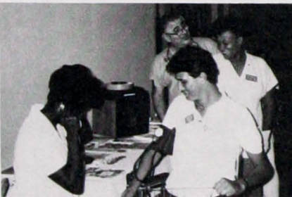
Blood pressure screenings were offered to the public at Southern Maryland Hospital Center.