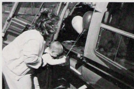
Checking out the MSP Med-Evac helicopter at the Baltimore County Fire Expo.