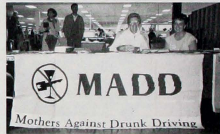
Members of MADD passed out literature at Valley Mall during EMS Week.