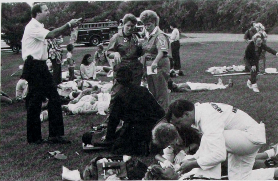
The secondary triage area of the disaster drill at the Magnolia Middle School in Harford County.