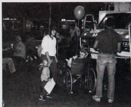
EMS Week activities at the Country Club Mall included blood pressure screenings and an ambulance display by Southern Garrett County Rescue Squad.