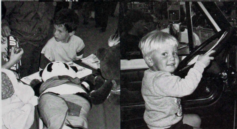
The "Traveling Teddy Bear Emergency Department" gave children the opportunity to learn about emergency medical procedures and ambulances.