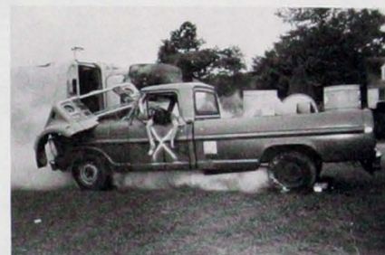
A mock crash of a school bus loaded with students hit by a pick-up truck during Harford County's disaster drill.