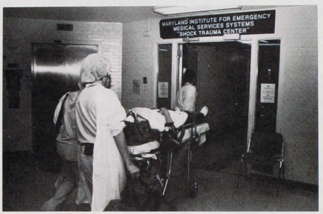
A patient is brought to the Shock Trauma Center.