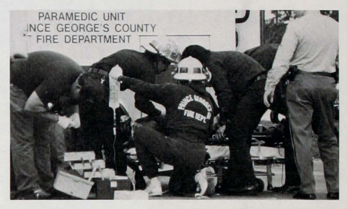
At a personal injury accident at Kenilworth and Upsher, a Prince Georges County Fire Dept. paramedic unit starts an IV.