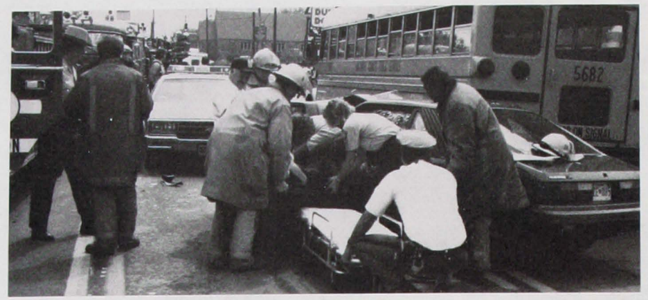
Medic 10 (Parkville), Truck 8 (Fullerton), Engine 71 (Essex), and Paramedic Supervisor 6 (Fullerton) respond to a crash at Belair and Salvo Roads where a car struck a school bus. None of the children was injured.