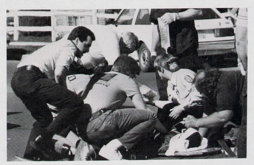
Prince Georges County Fire Dept. crews from Medic 6 and Engine 9 treat a pedestrian struck at 57th and Annapolis Rd.