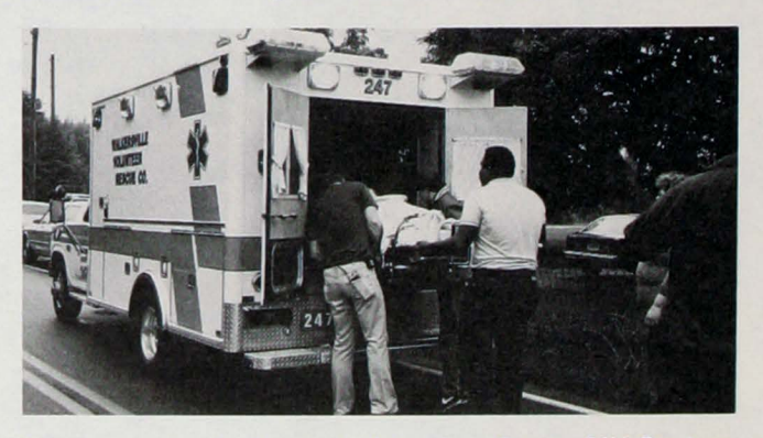
In a classic example of mutual aid, Loudoun County (VA) Car 1, as well as EMTs from Florida and New York who were traveling with Loudoun County's director of fire-rescue and emergency services, responded to assist Walkersville Ambulance Company, Frederick County ALS, and Lewistown Volunteer Fire Dept. Special Unit with a high-risk obstetrics patient reporting imminent delivery with problems occurring.