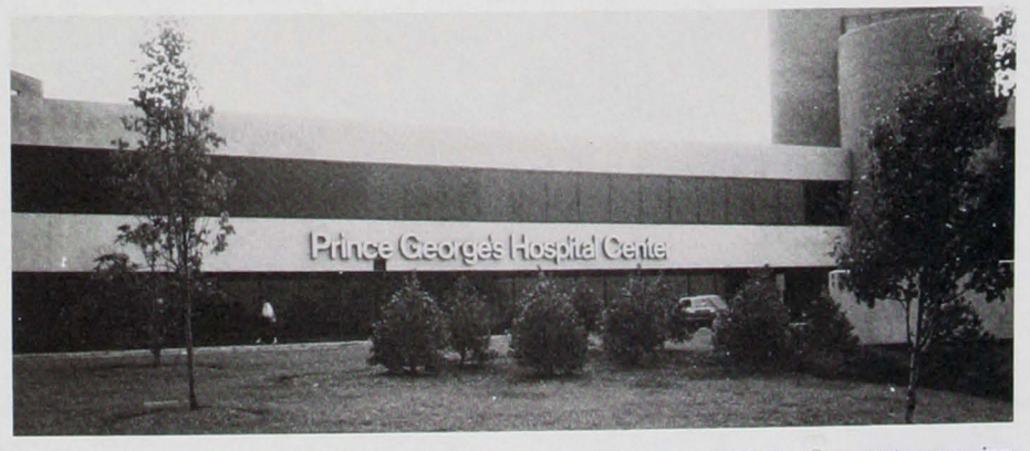
Prince George's Hospital Center in Cheverly is one of three areawide trauma centers serving Region V.