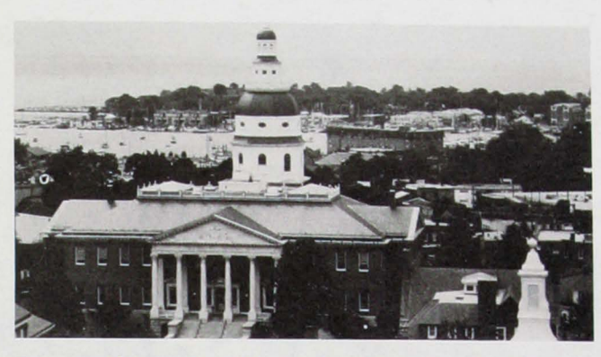
Governor William Donald Schaefer and the Maryland General Assembly funded increases in EMS allocations this year to benefit the citizens of Maryland.