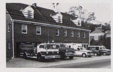
Station 4, Sandy Spring Volunteer Fire Dept. morning line-up for inspection.