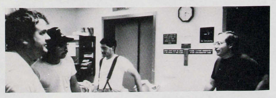
At 6:15 am, volunteer EMTs and CRTs from Reisterstown Volunteer Fire Dept. and Hampstead Volunteer Fire Dept. wait outside the Shock Trauma Center admitting area as another crew member completes the ambulance runsheets. After they return to their stations, it's on to their full-time career jobs.