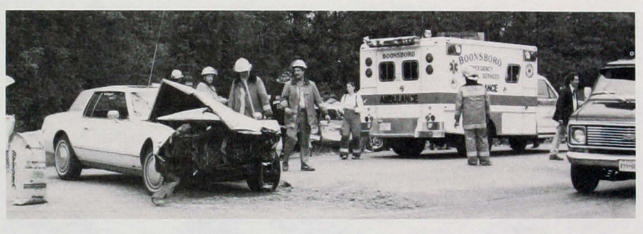
EMTs from Boonsboro Ambulance Service and firefighters from Mt. Aetna Volunteer Fire Dept. at an auto crash in Washington County.