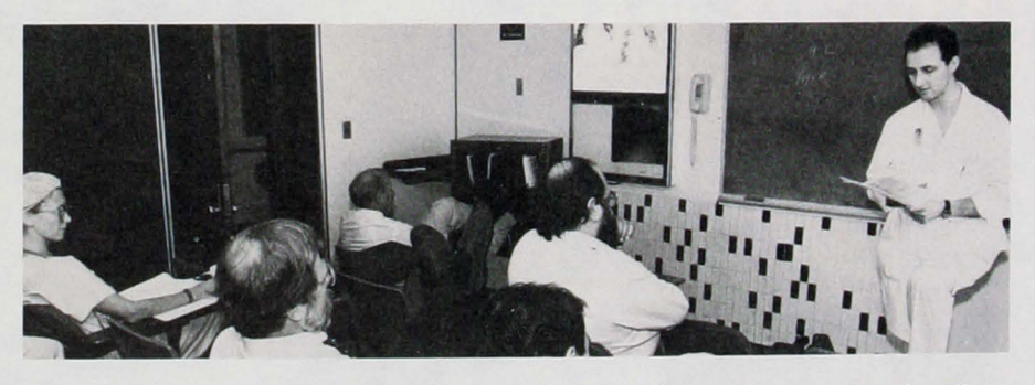
Critical care recovery unit morning conference at the Shock Trauma Center, an interdisciplinary review of critical patients by intensivists, surgeons, infectious disease specialists, radiologists, and surgical subspecialists.