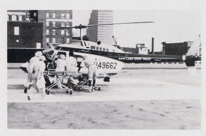
A patient transported by MSP helicopter is met by Shock Trauma Center admitting staff on the heliport.