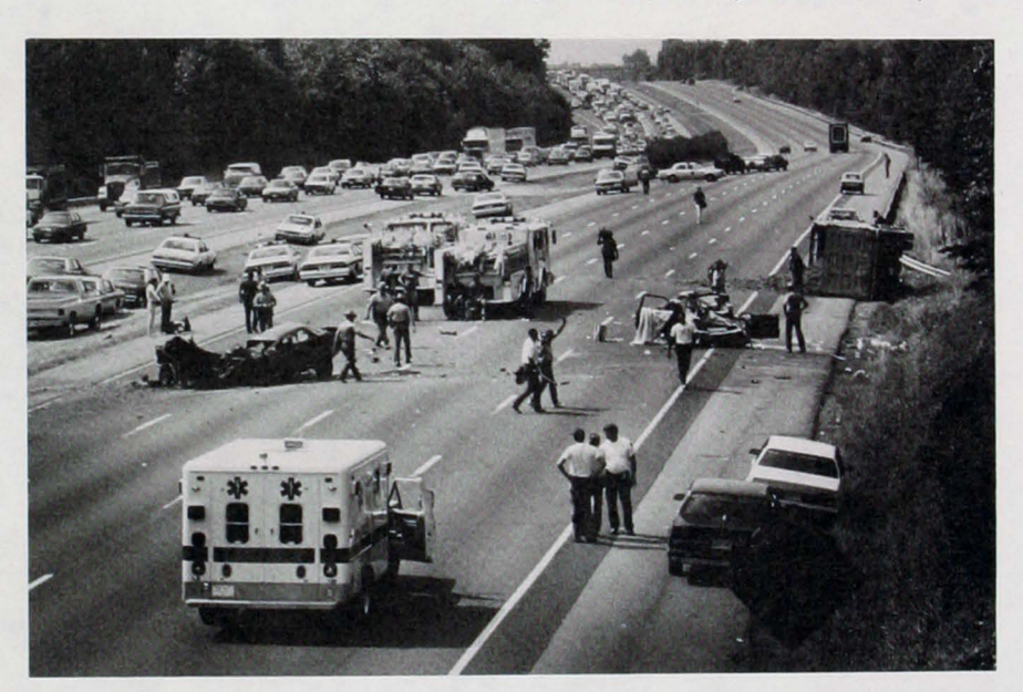
Prince Georges County Fire Dept. responds to a fatal accident on I-95 between Rt. 50 and Landover Rd.