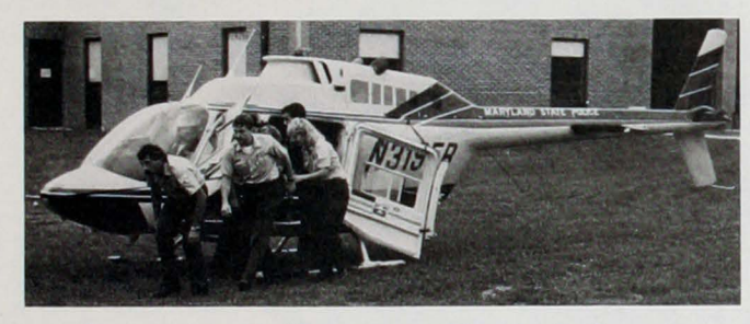
Transporting a Med-Evac patient.