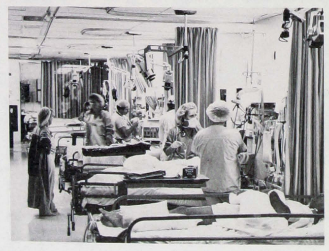
Caring for patients in the MIEMSS Neurotrauma Center.