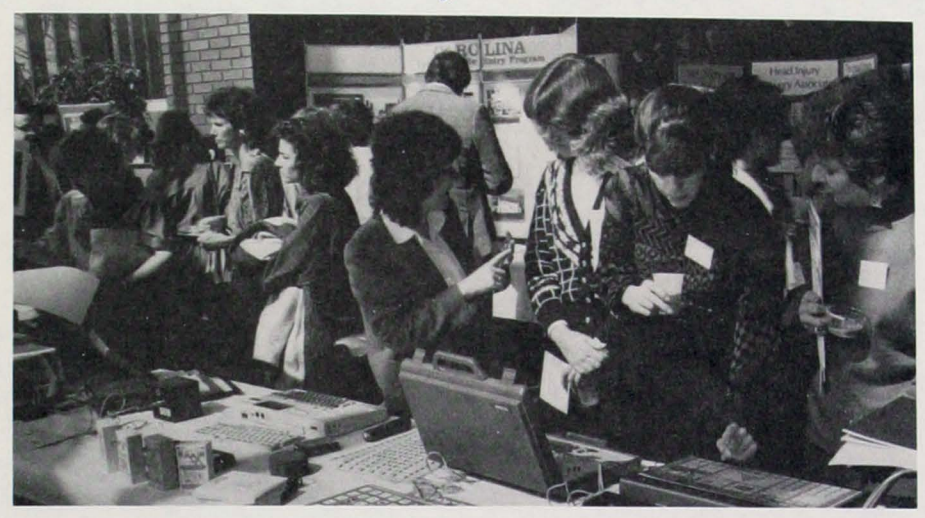
Twenty-seven exhibitors from around the country displayed products and services at the traumatic brain injury symposium.

Special attention was also focused on the pediatric and adolescent trauma rehabilitation track, which made the audience realize that "big" problems do come in "small" packages. Other tracks included "Rethinking Vocational Rehabilitation and Community Re-Entry: National Perspectives," "Contributions to the Rehabilitation of the Brain-Injured Survivor: Occupational and Speech-Language Path-