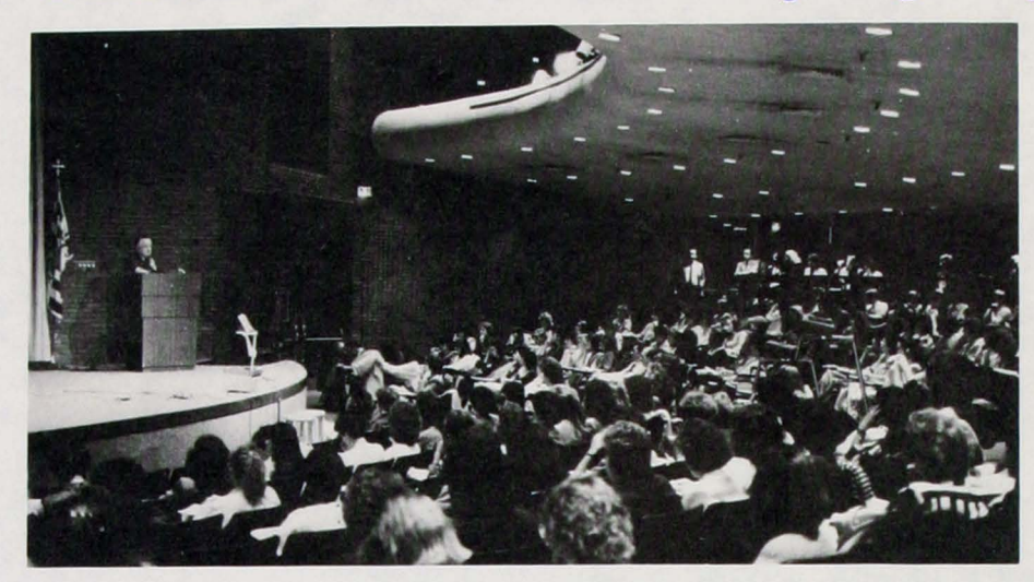
More than 525 professionals attended the 4th National Traumatic Brain Injury Symposium.