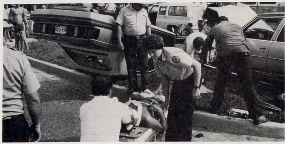
EMT-As must be recertified every three years after completing a continuing education program.