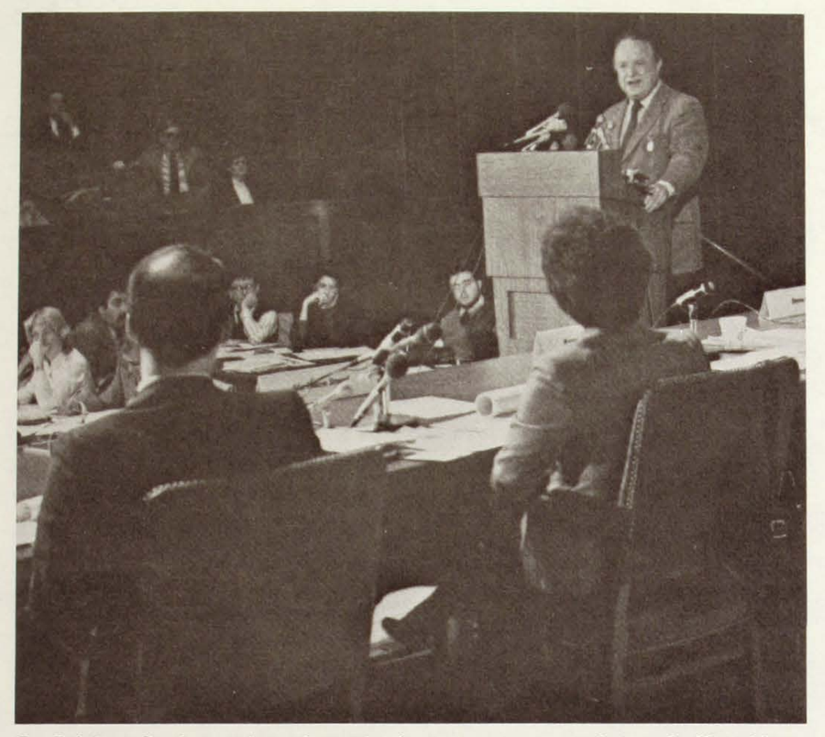
Dr. R Adams Cowley testifies in favor of air bags or automatic seat belts at the United States Department of Transportation hearing on automatic restraints.