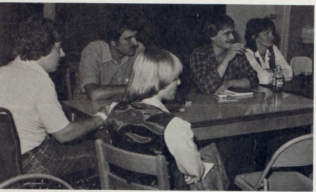
(Above) family counseling; (below) recreation!

The LEEP program uses a systematic, highly structured psychosocial and behavioral approach. Each week includes activities involving psychodrama, dance and movement therapy, transitional skills, and group therapy. Sessions in substance abuse, cosmotology, and leisure skills have also been offered. Clients meet Monday through Thursday from 9:00 am until 2:30 pm for 11 weeks.