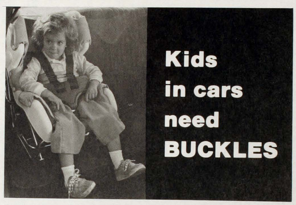
The above poster was distributed in conjunction with two public service announcements (PSAs) produced by MIEMSS. The 20- and 30-second PSAs began airing in the Maryland and D.C. areas in March. The slogan "Kids in Cars Need Buckles" concludes the PSA which stresses that traffic accidents are the chief killer of children and that 9 out of 10 children that die on the highways could escape injury or death by buckling in.

To consolidate the efforts of various state and local community groups, such as the General Federation of Wo-