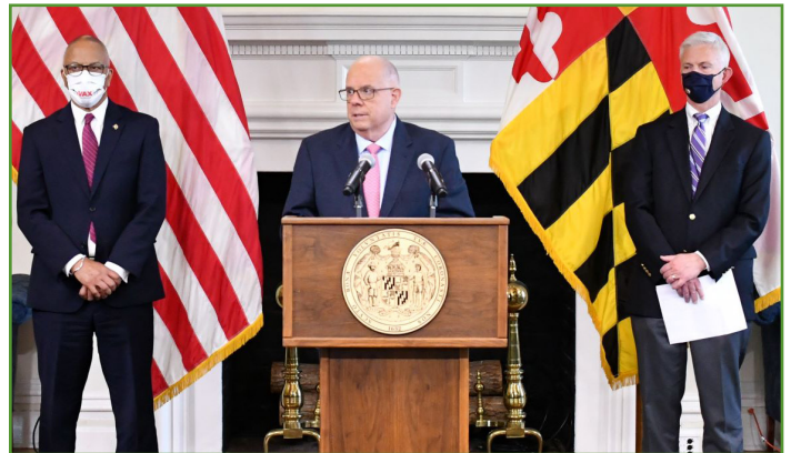
▲ Maryland Governor Larry Hogan is flanked by Lt. Governor Boyd K. Rutherford (left) and MIEMSS Executive Director during COVID-19 press conference on April 5, 2021, in Annapolis.

The next day, Governor Hogan issued an Executive Order, “Augmenting Emergency Medical Services”,