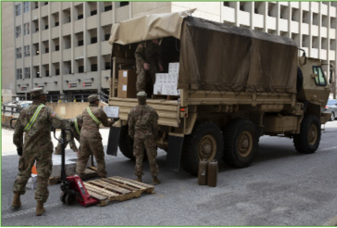
▲ Members of the Maryland National Guard deliver PPE to MIEMSS Headquarters in Baltimore for statewide distribution.