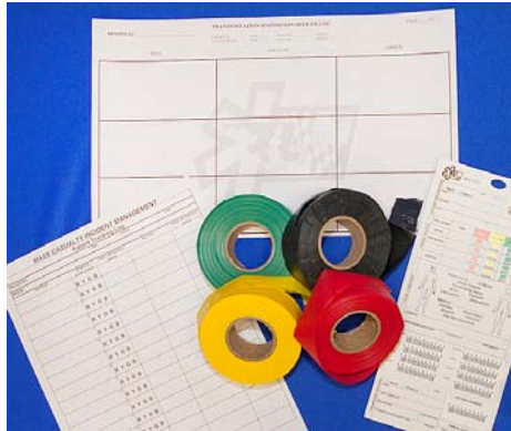
Minimum Requirements for the Maryland Triage Tag Kit