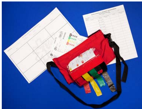
Enhancements to the Maryland Triage Kit requirements