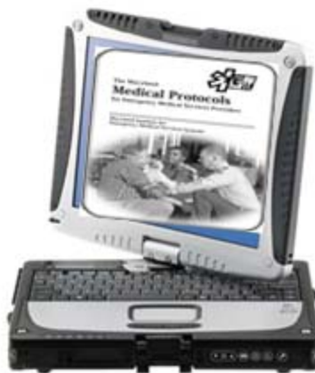
Full Electronic version of "The Maryland Medical Protocols for EMS"