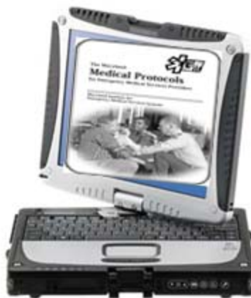
Full Electronic version of 'The Maryland Medical Protocols for Emergency Medical Services'