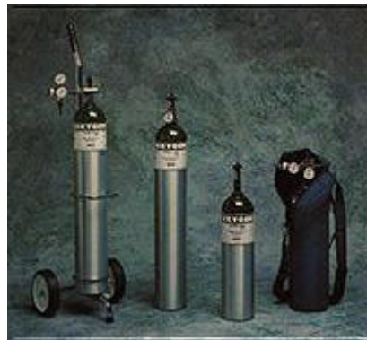
Typical portable systems