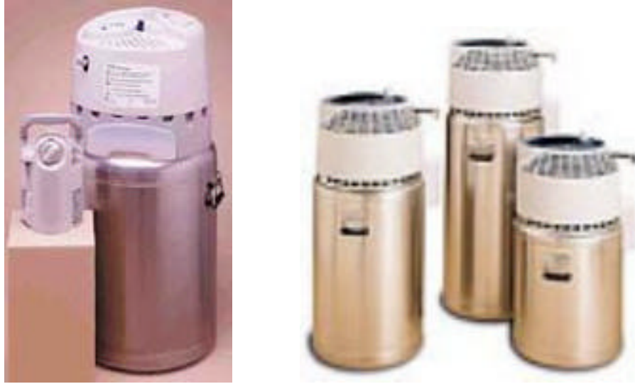
Typical LOX base stations.