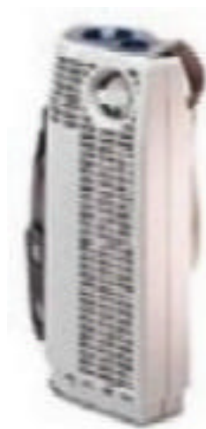
Typical portable LOX units