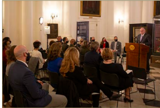
▲ Governor Larry Hogan delivers remarks during the 18 th annual Maryland Remembers ceremony honoring those who have lost their lives as victims of impaired driver crashes.

Maryland Remembers is held annually at the beginning of the holiday season, when impaired driv-