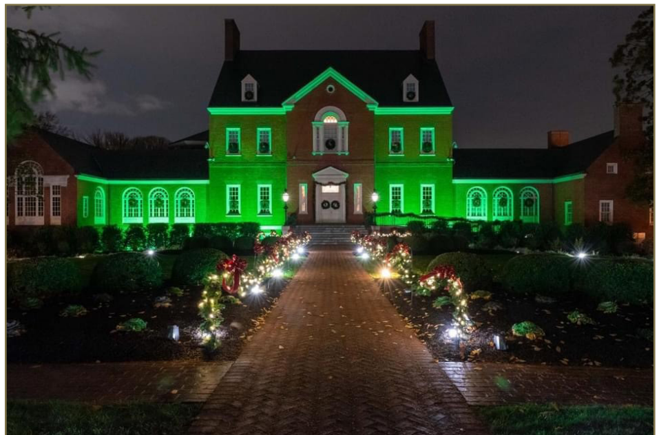
▲ Government House in Annapolis was illuminated green on November 18, 2021, as part of the “Shine a Green Light” initiative to elevate the profile of National Injury Prevention Day.