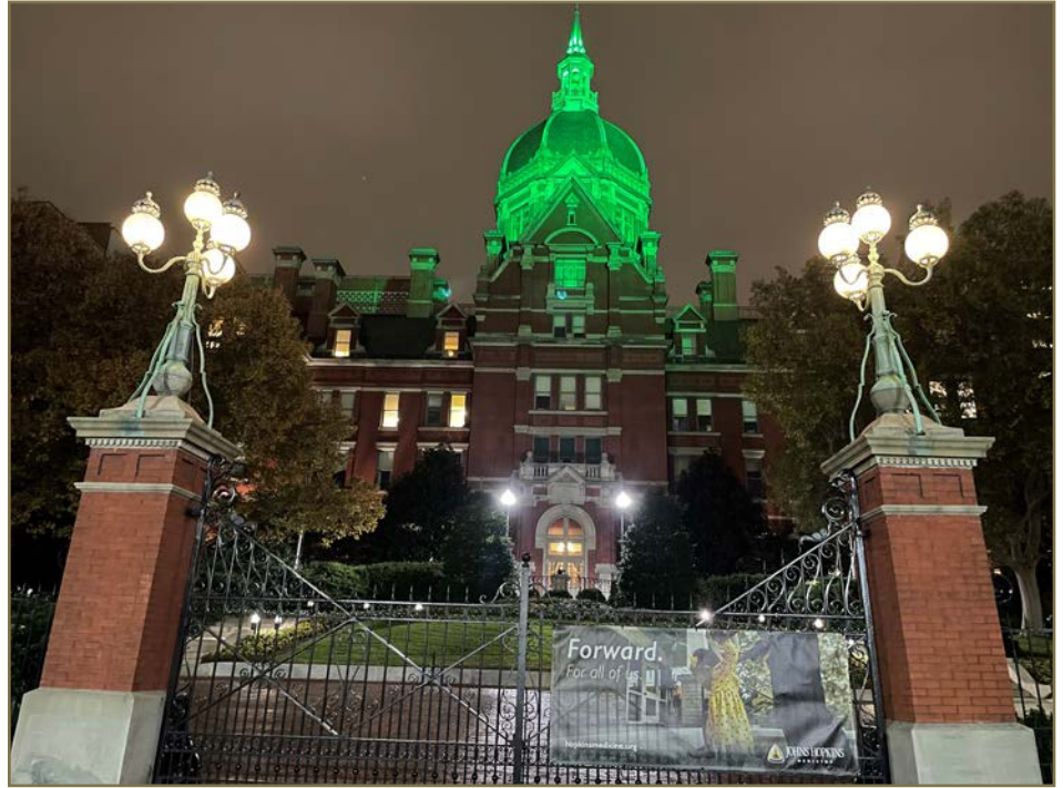
The Johns Hopkins Dome (above) and Sinai Hospital (below) were among the hospitals, landmarks, businesses, monuments, neighborhoods, and government offices across America that were illuminated green as part of the “Shine a Green Light” initiative to elevate the profile of the cause.

In Maryland, the state Safe Kids Maryland Coalition works with seven local Safe Kids coalitions and seven local community partners throughout the year to increase awareness about injury risks and to provide both education on prevention strategies and safety tools (car seats and bike helmets) to families. Safe Kids Maryland, in partnership with the Risk Watch subcommittee of the Maryland State Firemen's Association, organizes “Steps to Safety” interactive learning stations every June at the MSFA Convention. These stations provide children with hands-on learning activities, families with printed materials focused on home and community safety, youth Fire Prevention Ambassa-